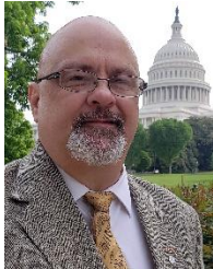
Certified Legal Investigator

PRIDE – Professional Reliable Investigators Defining Excellence