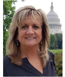
Bachelor in Social Work